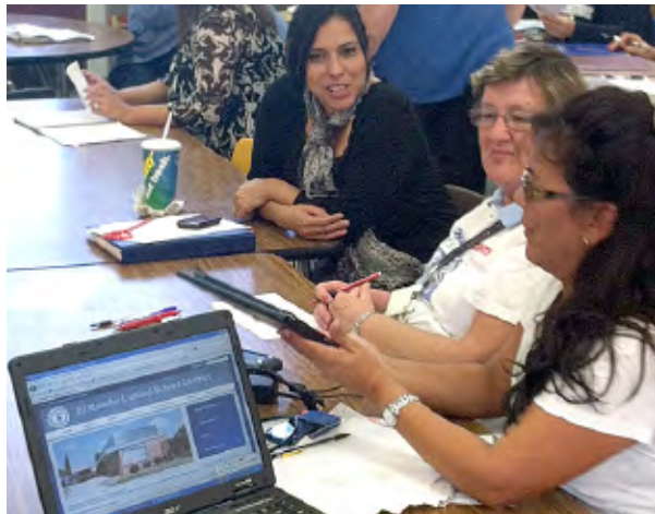
Teachers working together.

Research has shown that the collaboration among teachers has been identified as one of the factors that has the highest impact on a school’s ability to improve student learning. All the stakeholders at Birney, including students, staff, parents, and the community, benefit from our culture of collaboration.