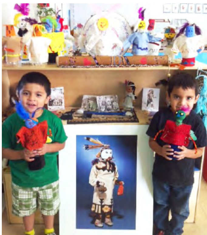
Preschool students display Native American Kachina dolls

After learning about the artists and studying their work, children then roll up their sleeves and get to work producing their own masterpieces. Using a variety of materials- such as oil pastels and clay-children produce original work inspired by the style and techniques of the masters they have studied. From three dimensional Native American inspired sculpture, to formal floral still life paintings in the style of Van Gogh,