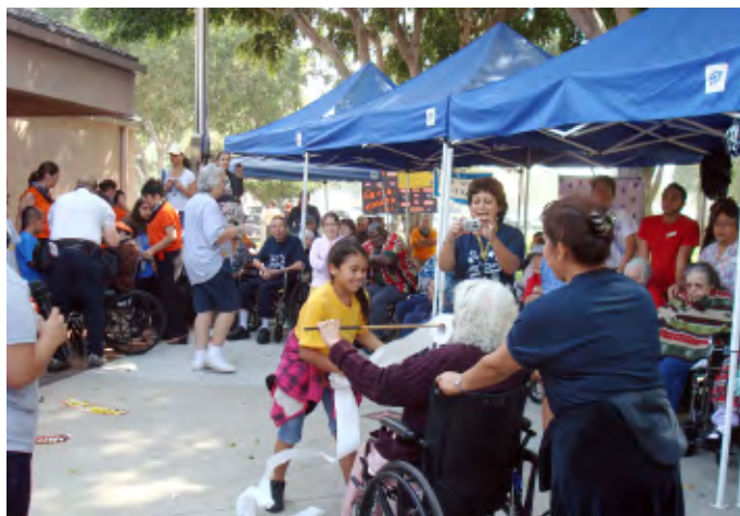
Junior/Senior Olympics at Smith Park

Counts! for four years now and have really begun to see changes in our school climate and student behavior. Our students practice their six pillars diligently. As a result, our fifth-grade class had the opportunity to show their caring nature by participating in