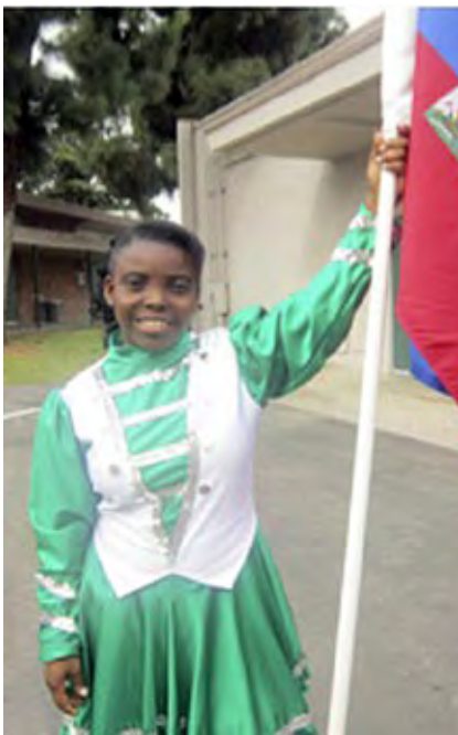
Young girl from Haiti

El Distrito Escolar Unificado El Rancho está extraordinariamente orgullosamente del mensaje que estos jóvenes mandan a todos quienes son afortunados de haber sido tocados por estas de sus tres metas.