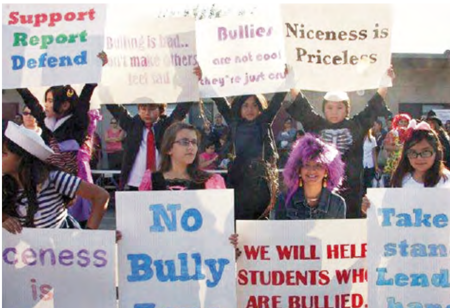
Student Council members led our school community in a rally to kick off the Olweus Bully Prevention Program.

We have hit the ground running and look forward to a successful school year.