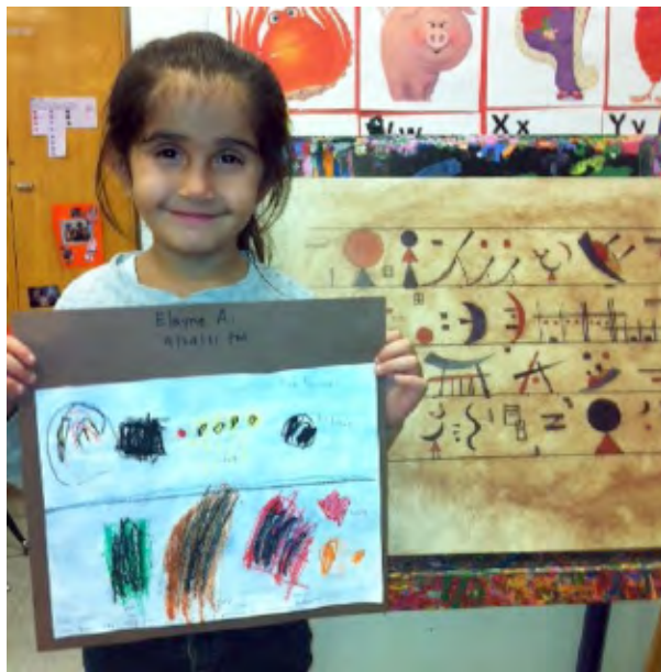
Proud preschooler shares Kandinsky inspired artwork.

As an early educational program, our goal is simple; each day we strive to provide children with a world class preschool experience that will provide them with the foundation to excel academically and become absolutely anything or anyone they desire.