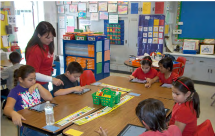
Rivera students use iPads2 to enhance their education

Rivera is a technology rich school with this year an iPad2 cart added to the resources available to the teachers.