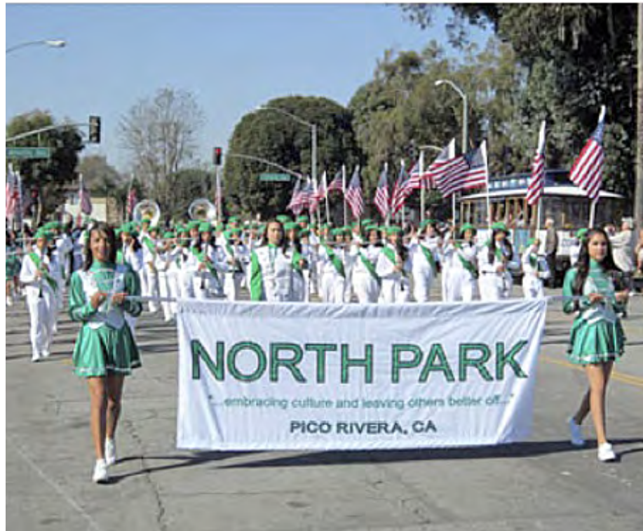
North Park Band band, surrounded by 45 United States flags, marched to the music "God Bless America."

La banda de la Escuela Intermedia North Park esta marchando ahora por un propósito más alto. En lugar de competir como lo hacian en el pasado, North Park ha adoptado un nuevo estilo que le llaman "Abrazar otras culturas y dejar a otros con un sentido mejor."