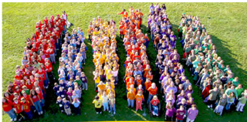
Students representing the six pillars of Character Counts: Trustworthiness, Respect, Responsibility, Fairness, Caring, and Citizenship

The initiative focuses on: safe school environments and violence prevention activities; alcohol and other drug prevention activities; student behavioral, social, and emotional supports; mental health services, and early childhood social and emotional learning programs. Through the implementation of SS/HS programs and activities, the district's goal is to reduce truancy, decrease disciplinary actions, and improve student academics. The SS/HS grant is geared towards creating a safe and healthy learning environment for students and their families.