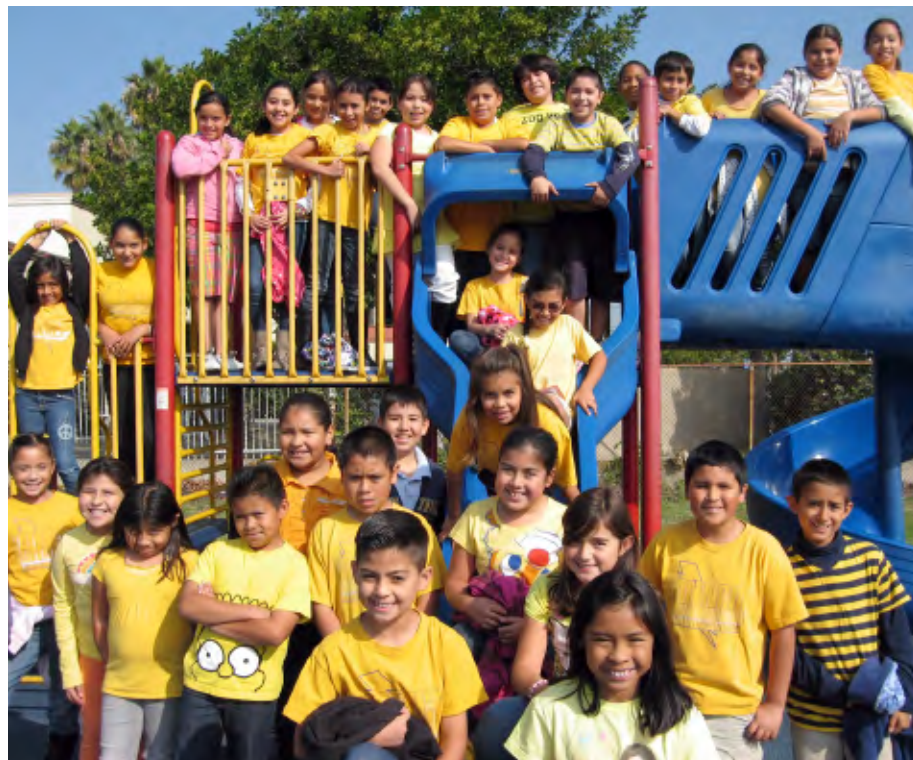
Students wearing yellow for the "Respect" pillar during Anti-Bullying Awareness Week.

the Junior/Senior Olympics with residents of El Rancho Vista Convalescent Center this past September. Valencia staff members are also preparing to launch the Olweus anti-bullying program in early spring. We have already begun anti-bullying conversations with our students and held several activities during National Anti-Bullying Awareness Week in November. We are enthusiastically anticipating much success addressing these issues.