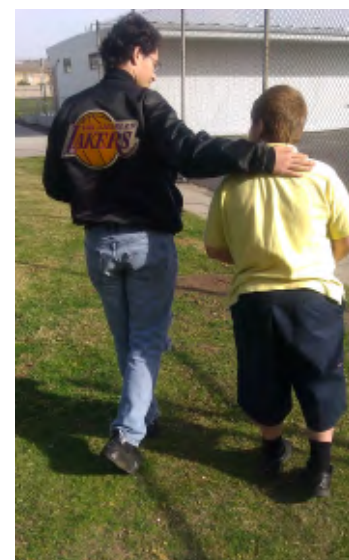
A successful dual enrollment student serving as a role model for our younger students at Obregon.

Dual enrollment has proven to be an invaluable tool for our campus which is comprised of students who have unique needs and who are working hard to prepare themselves to return to their home schools. We currently have four amazing students who spend a portion of their day at El Rancho High School while also attending our program for the remainder of their day. This arrangement allows them to experience the activities and culture of a typical high school setting with over 3,000 students while still being able to benefit from the multiple supports and therapeutic nature of our campus. We are grateful for the teamwork and collaboration we share with our neighboring schools and very proud of our students who are working so hard to achieve success in their educational pursuits.