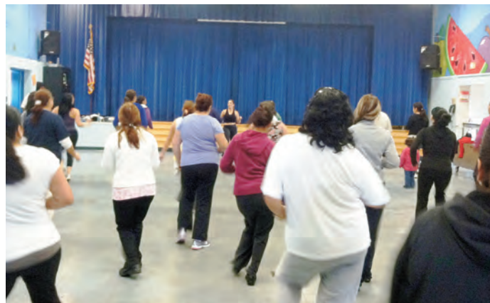
The Eucalyptus parents are improving their health each week during exercise classes held in the cafeteria.

A trained leader from the program travels throughout classrooms during the school day and engages students in quick physical activity breaks. Students and teachers are moving to music and getting much-needed opportunities to burn some energy before getting right back to academics. This grant also supports the Eucalyptus parents, and as a result we have recently started up an energy-packed Zumba class which is open to all parents every