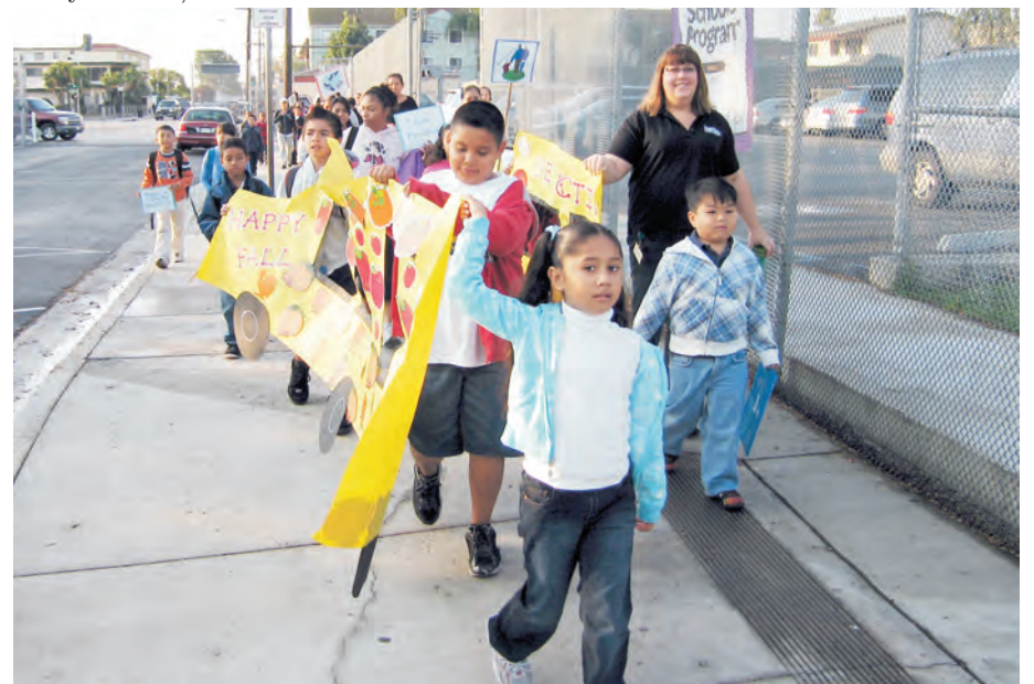
Walk to School Day.

All of our students were given orange slices when they first arrived at school, with a reminder to eat more fruits and vegetables and stay physically active every day. Overall, it was a successful event!