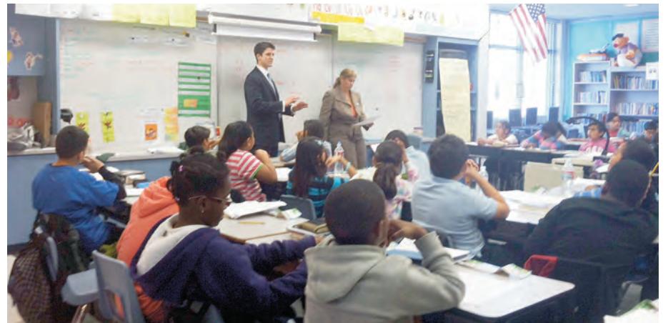
Kornblum Project Lead district attorneys