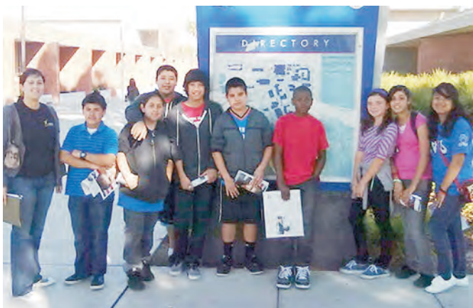
The small group is AVID students at El Camino Jr. College.

Parents are partners in our quest to make students learners today and leaders tomorrow.