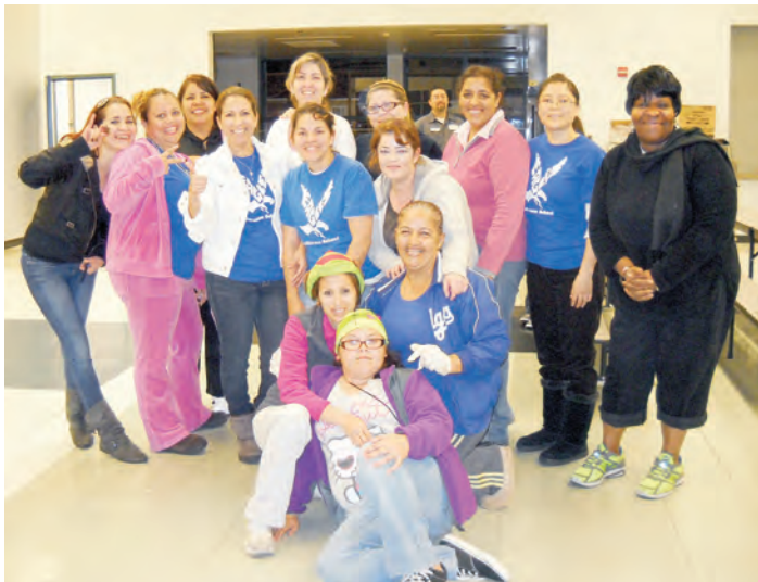
Jefferson parents enthusiastically volunteer for Family Movie Night Under The Stars.

Center each Tuesday morning from 9:00-11:00. All parents are welcome to attend these meetings. Our parent volunteers recently provided a cute literacy puppet show for all 3 kindergarten classes, and they sold refreshments for our family movie night under the stars. Great job!